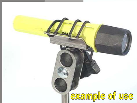
example of use