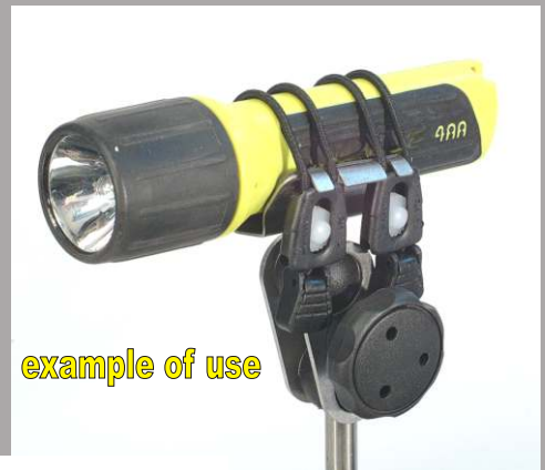
example of use