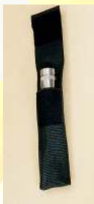
Image shows OS belt loop ( belt loop with a hook and loop closure)