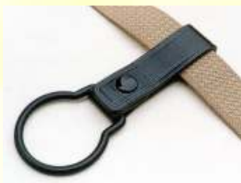
Belt Ring f. D-Cell