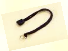
Loop cord with split ring.